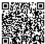
E-professionalism in the Health Professions: Selected Readings