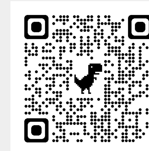
QR Code to Author Services from Himmelfarb

Overview page for Author Services from Himmelfarb