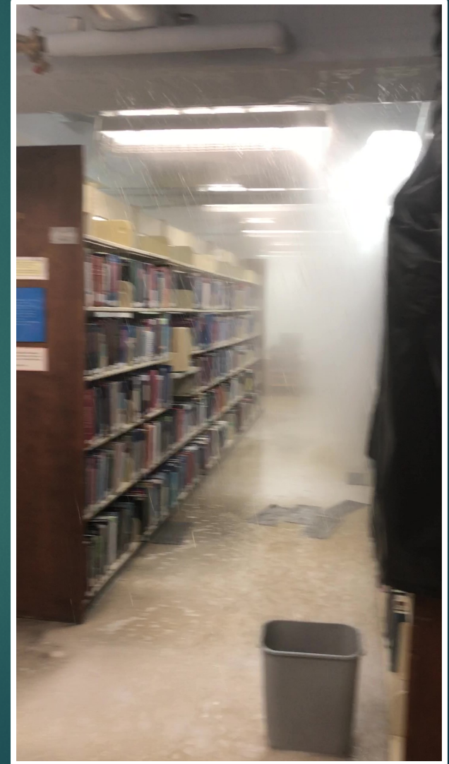
Himmelfarb Library Stacks, Feb. 2019