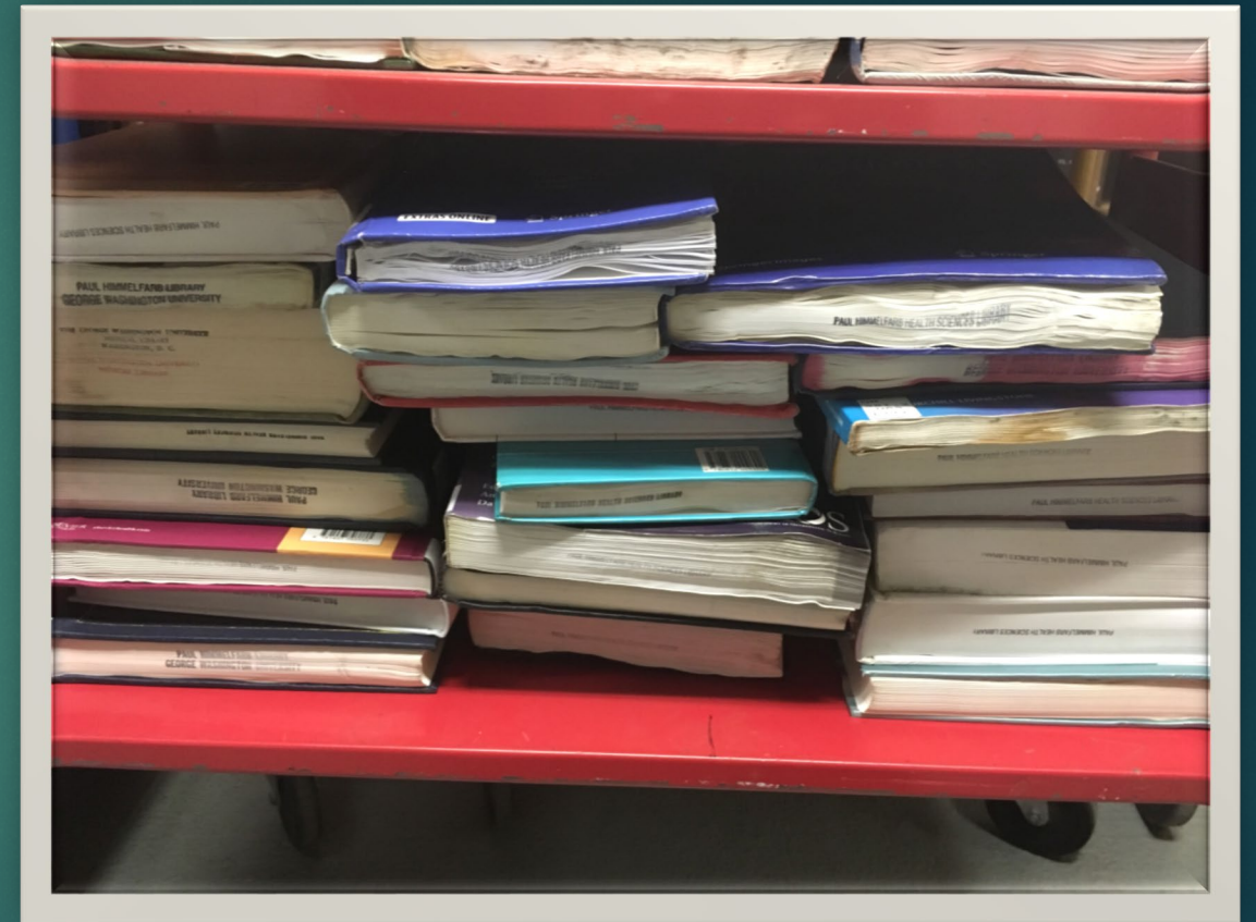
Himmelfarb Library Stacks, Feb. 2019