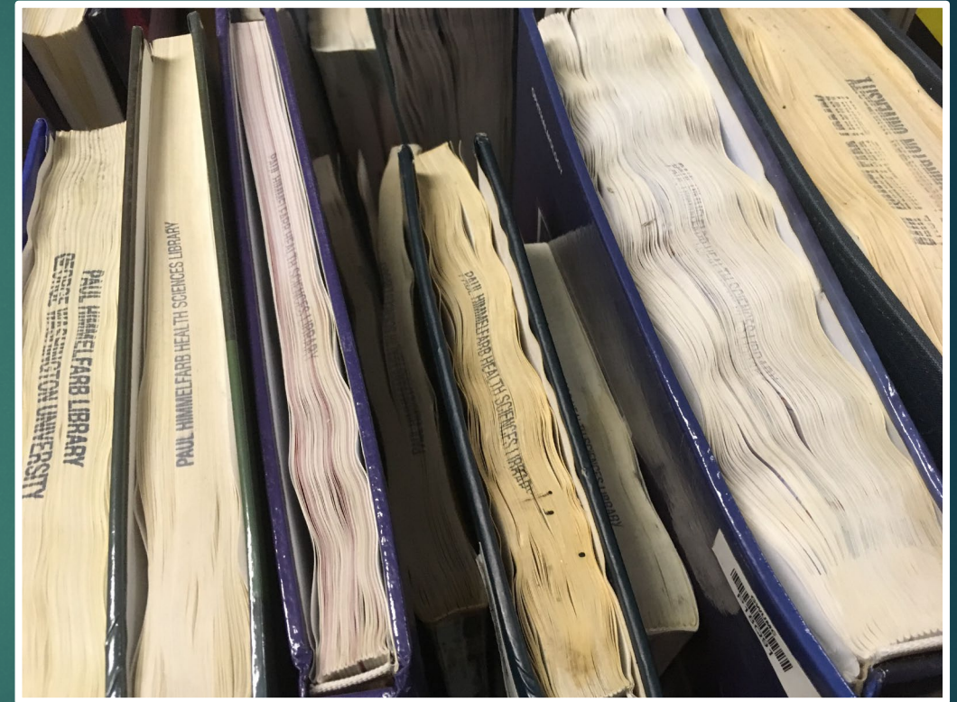
Himmelfarb Library Stacks, Feb. 2019