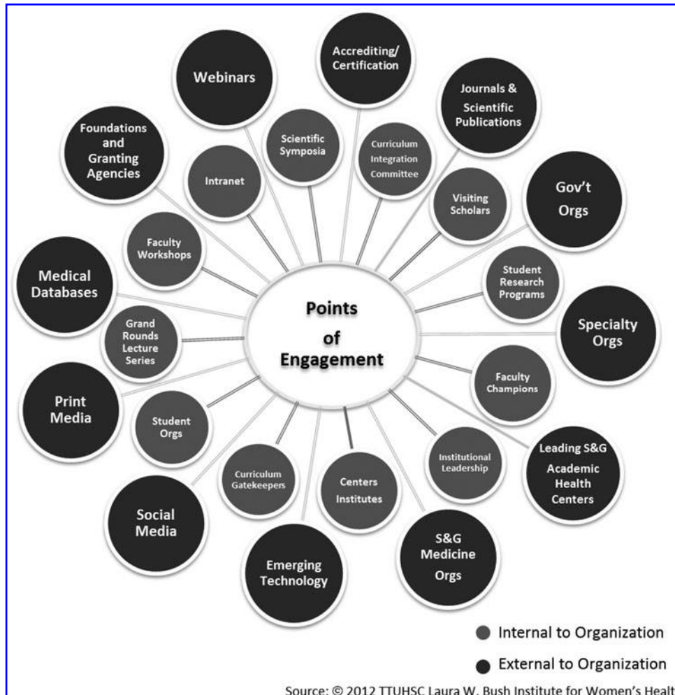
FIG. 3. Schematic of stakeholders internal and external to an organization and tools to be engaged in implementing sex and gender concepts into medial education. Examples of Accrediting and Certification Bodies : Liaison committee on Medical Education (LCME), Accreditation Council for Graduate Medical Education (ACGME), American College of Obstetrics and Gynecology (ACOG); Curriculum Gatekeepers : Deans of Curriculum, Block Leaders, Educational Policy Committee, Curriculum Integration Committee, Core Faculty Group Leading the Curriculum Integration; Emerging Technologies : Smart Phone and Tablet Apps; Faculty Champions : Grass-roots engagement of Basic and Clinical Faculty to Pioneer Efforts and Engage Others; Institutional Leadership : President, Deans, Assoc/Asst Deans, Chairs; Sex and Gender (SG) Medicine-Focused Organizations & Initiatives : Society for Women’s Health Research, Sex and Gender Women’s Health Collaborative, Organization for the Study of Sex Differences, International Society of Gender Medicine, North American Menopause Society; Government Organizations : Department of Health and Human Services Office for Women’s Health, National Institutes of Health Office for Research on Women’s Health, Federal Drug Administration, Health Resource Service Administration; Medical Database/Search Engines : Pub Med, Ovid, Up-to-Date, Medscape, MD Consult; Journals & Other Scientific Publications : Gender Medicine, Journal of Women’s Health, Institute of Medicine Reports; Print Media : Monographs, Reviews, Commentaries; Specialty Organizations : American Academy of Family Medicine (AAFM), American Board of Internal Medicine (ABIM), American College of Physicians (ACP), American Congress of Obstetrics and Gynecology (ACOG), Association of Professors in Gynecology and Obstetrics (APGO), American Medical Student Association (AMSA), Association of American Medical Colleges AAMC); Social Media : Blogs, Twitter, Facebook, LinkedIn Webinars & Online C.

Initial funding for the Sex and Gender Women’s Health Collaborative came from American Medical Women’s Association and American College of Women’s Health Physicians. The future challenge is to find mechanisms and funds to sustain the site through outreach to various professional