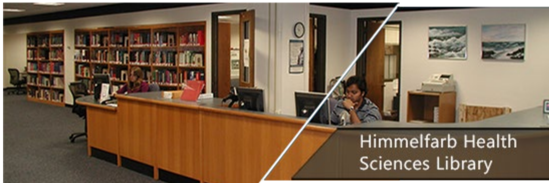
Himmelfarb Health Sciences Library