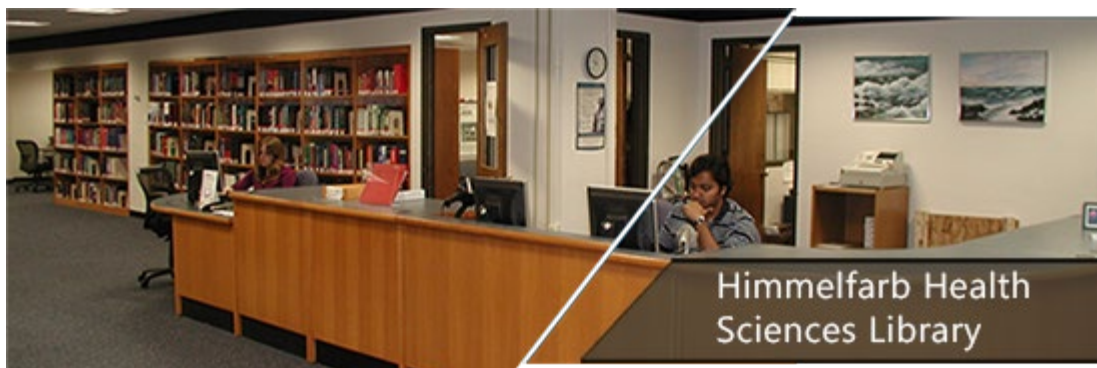
Himmelfarb Health Sciences Library