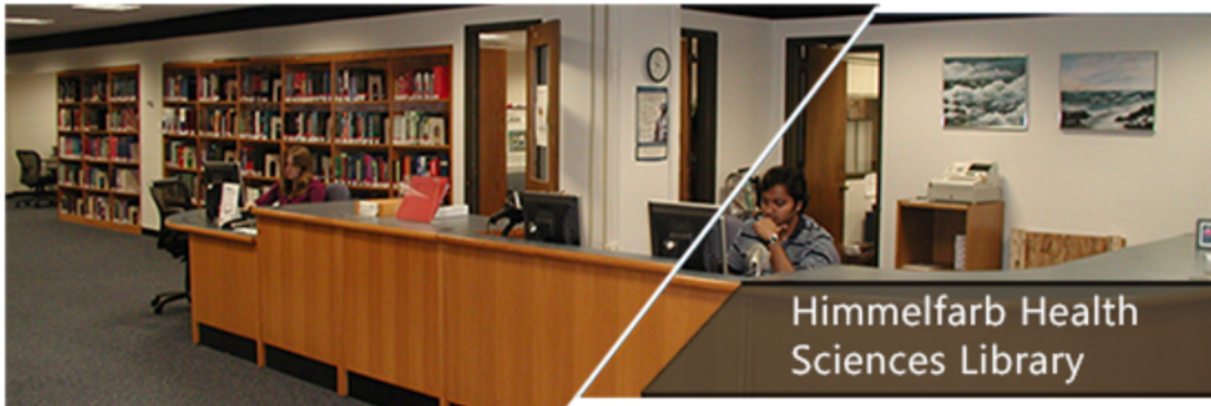
Himmelfarb Health Sciences Library