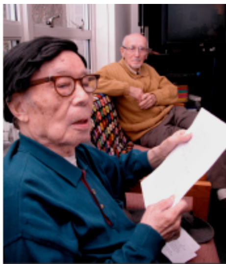
Oldest participant in the study—turned 101 during 2005—reading the poem he wrote to the Brooklyn site poetry group. These groups provide strong camaraderie.