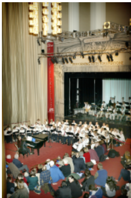
The Senior Singers' Chorale from the Washington, DC area study site, performing at the Millennium Stage of the Kennedy Center—one of several appearances they have made there.