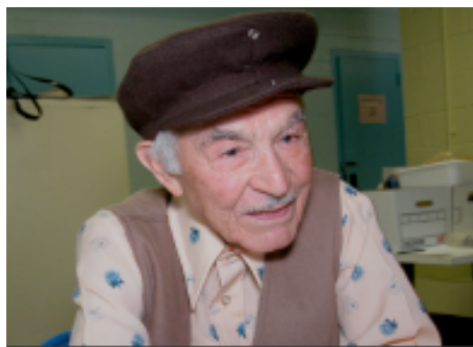
Member of a largely Spanish speaking, jewelry making group, at the Brooklyn site, describing the impact of this experience on his marriage. “This class saved my marriage. I make my wife something beautiful every week.”