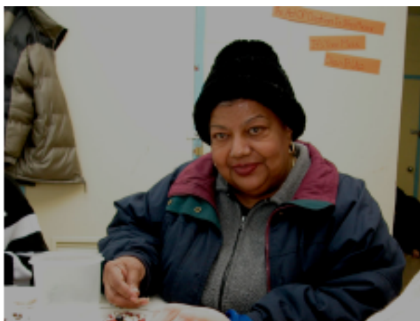
Participant in one of the Brooklyn art making groups, reflecting on her newly found sense of meaning and mastery: “This is my first time as an artist. Before one year ago, I only knew work”.