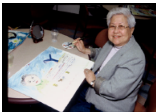
Participants in the art groups of the San Francisco site, demonstrating their accomplishment of mastery and control, and sense of satisfaction in the process.