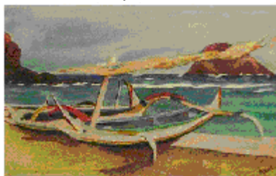
Catherine Hess Beached in Bali Watercolor

Image citation: Hess, C. (2009). Beached in Bali. [Online image]. Retrieved June 1, 2009 from http://www.gwumc.edu/library/about/2009artshow/ .