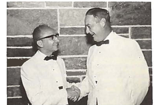
ON THE COVER

Medical School alumni led all other schools and colleges of the University in contributing to their Annual Support Program. Giving to the 1964-65 Annual Support Program, including the more than $50,000 from medical alumni and friends, exceeded $200,000 for the first time in the history of annual giving at The George Washington University. (See page 8 for donors' names.)