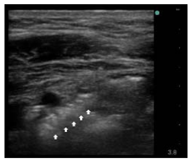
Figure 2. Catheter location is confirmed with injection of 2 ml of air (arrows).