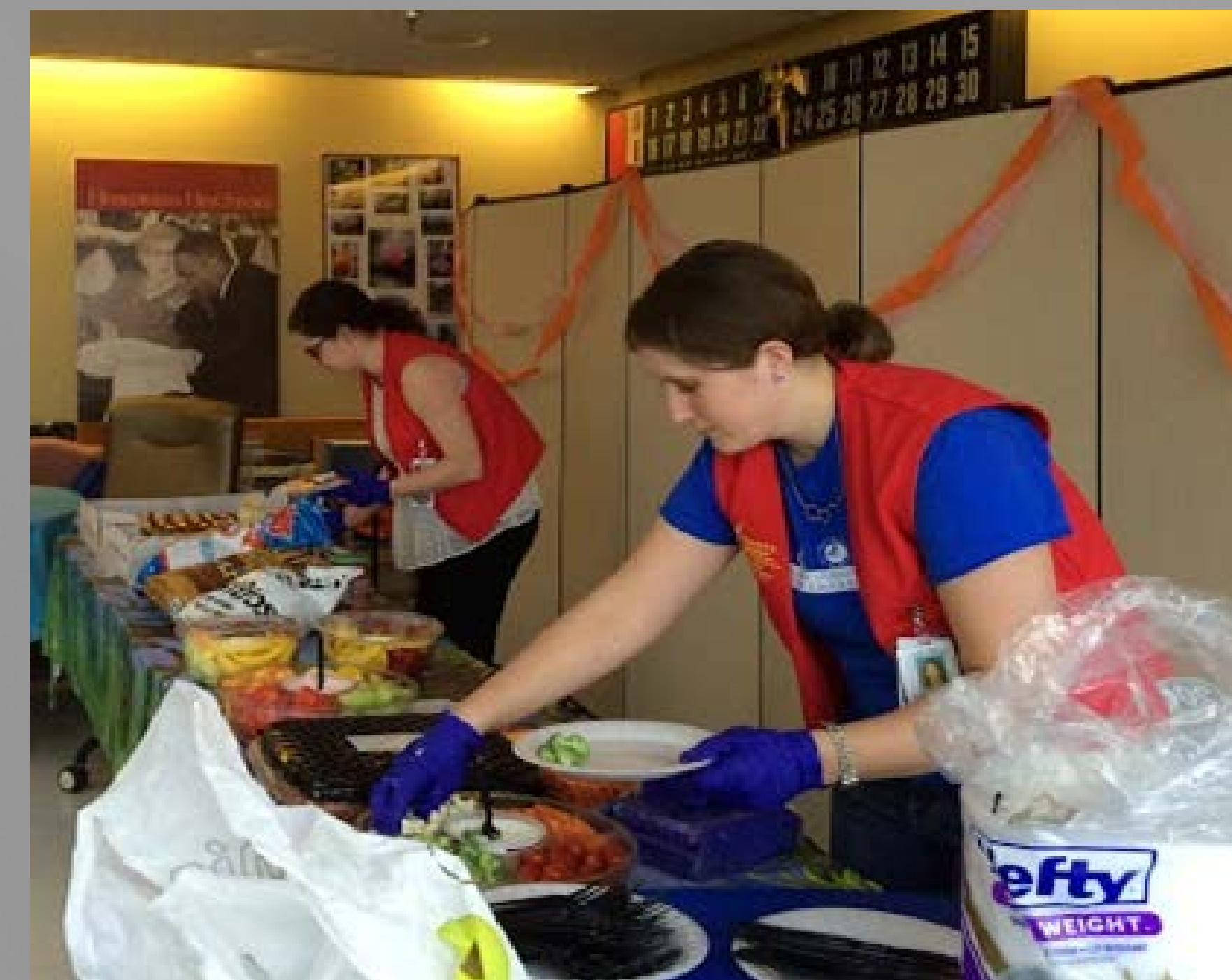
Starter Project: Hosting the monthly Birthday Celebration at the CLC. For October we also brought baby pumpkins and paint supplies as a craft.