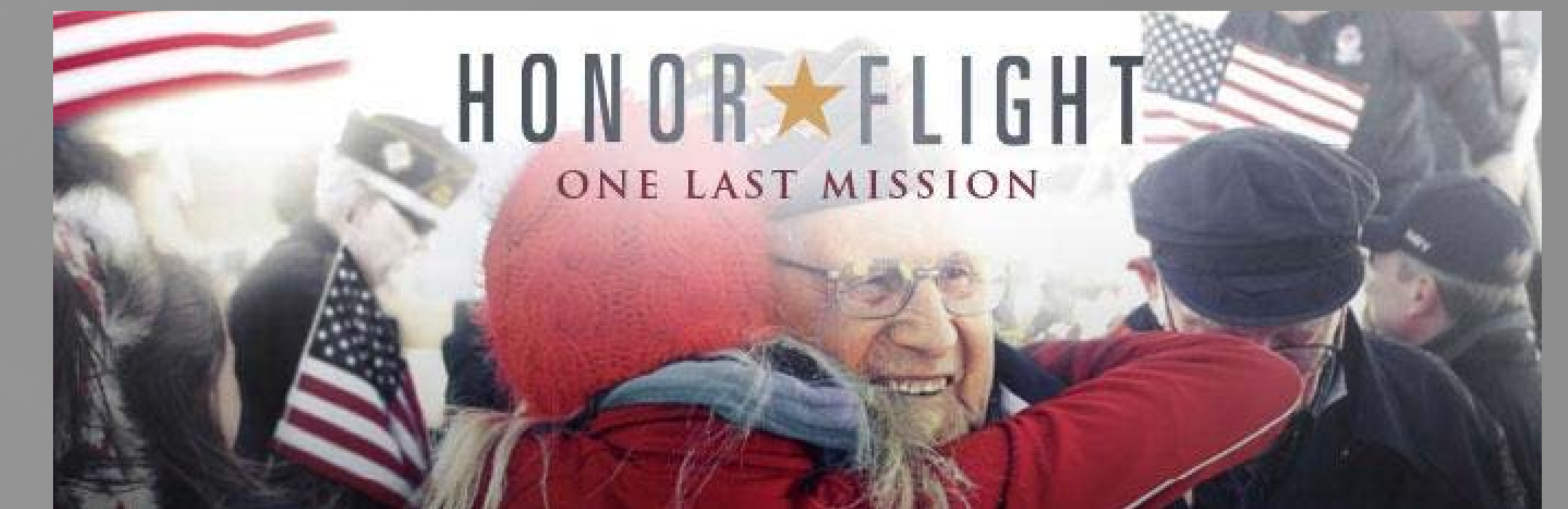
Cover of the movie Honor Flight, about bringing veterans from all over the United States to Washington D.C. to see the memorials; Held a screening for this movie for the GWU community; Shows how much listening can mean to veterans