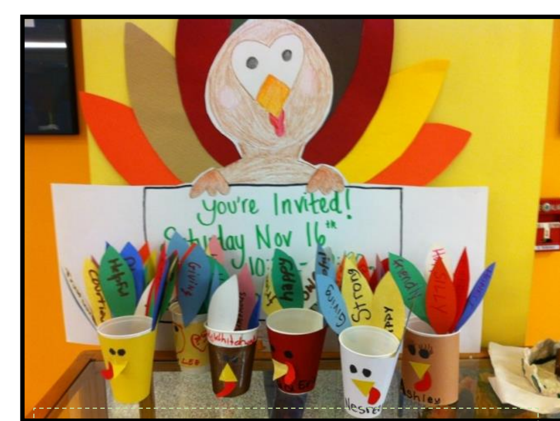
Thanksgiving Craft – Positive Turkey Cups

Body - Laughter Yoga - Healthy Eating - Chair Aerobics - Dancing