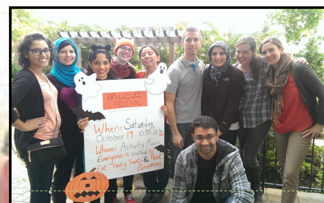
Senior Wellness Team