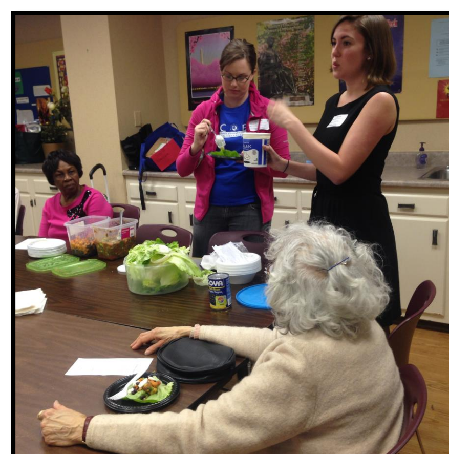
Showing an alternative to tacos – lettuce wraps!