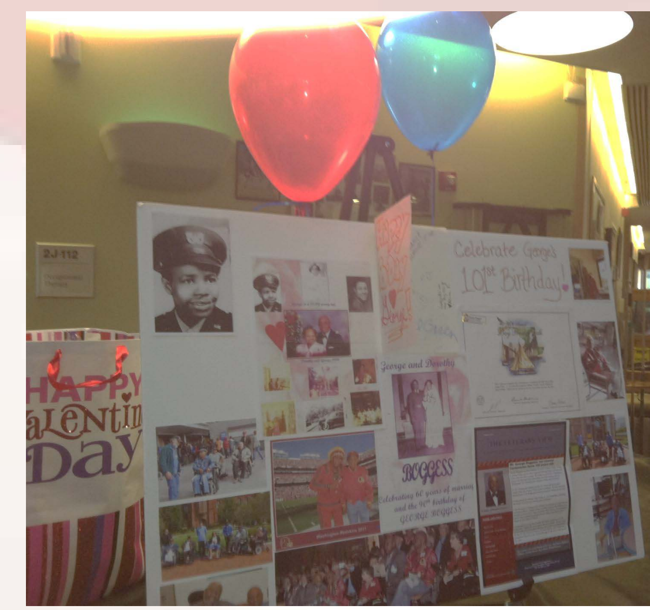
Honoring a veteran's service and life.