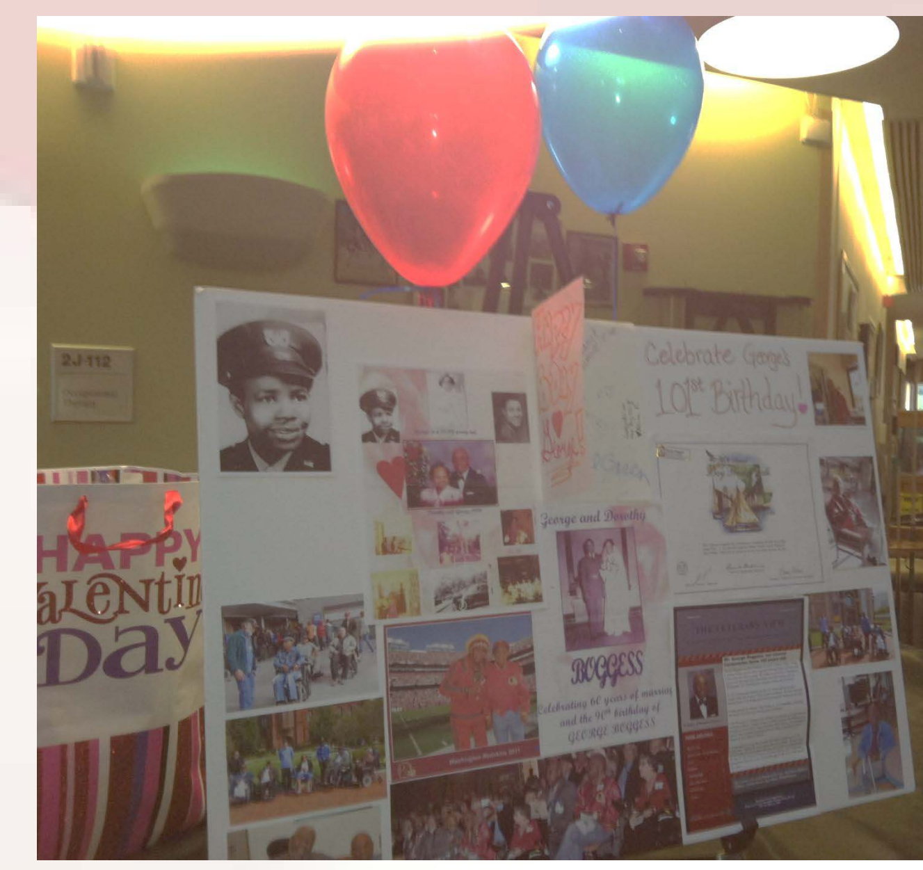
Honoring a veteran's service and life.