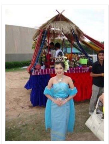
Nursing student in front of FoN Float

attending the festival. I'm not sure what that was about - I plan to investigate further to find out if there is any Thai cultural significance to