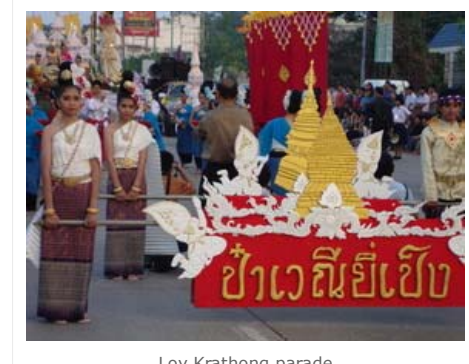
Loy Krathong parade

didn't dance. In contrast, the Faculty of Medicine appeared to be comprised of an inordinate number of talented float designers and male dancers. To be honest, it was like watching a gay pride parade but with straight Thai medical students, only the Thai medical students were way more flamboyant and were better dancers. The Faculty of Nursing had a fabulous float, beautiful and talented dancers, and a wonderful energetic spirit.