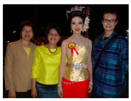
Me with student and administrators

Hmmm.....not exactly the collaborative approach I was hoping for but it's a start. The hosting professor took the microphone from me and made it very clear she will not be sharing her writing for feedback at the next session since she is a very busy person, but she expects the other faculty to provide feedback to each other in front of her at our next session. I could tell some of the participating faculty were a little uneasy with this, so I let the participants know I'd be available to work with them one-on-one between now and the next session so that they can get additional training and