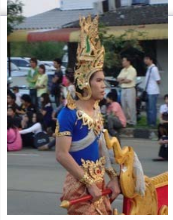
Male student carrying a banner in the

research paper - i.e. the core elements of an abstract, the minimal level of details required re: methodology, etc. Also, from a cultural perspective, they are somewhat baffled by editor's feedback and how to respond if they disagree with a particular comment from an editor. We talked about strategies for responding to editor's feedback and spent over 2 hours discussing the required structure and content of a well-developed abstract and research paper, using a JAMA article on patient outcomes between NP's vs MD's as an exemplar/teaching tool. The most interesting part of the class for me, however, was the discussion about giving peer feedback to faculty colleagues. Faculty members shared with me that in Thai culture, when you are asked to provide feedback on a paper or grant proposal, it is the expectation that you offer respectful praise and admiration but you do not provide criticism. We talked about strategies for providing peer feedback in a way that's both respectful and helpful, and the faculty seemed genuinely excited to have the opportunity to learn how to do this while I'm here in Thailand. I was hopeful that the faculty participating in today's workshop could practice some peer feedback between today and our next follow-up session, but the hosting professor said she wants them to wait and provide feedback for the first time in front of her at the next session so that she can tell them if they're doing it right.